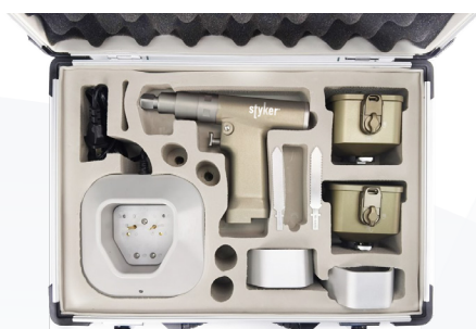
ST AC800 Aluminum case packing